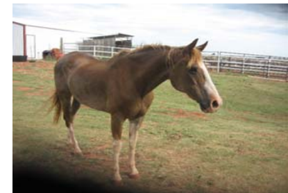
Lt. Dan—Equine Therapy Horse

Jeffers Equine (code horsefeathers) Farmers Grain (405) 341-3310 Tractor Supply gift certificates (405) 478-0333